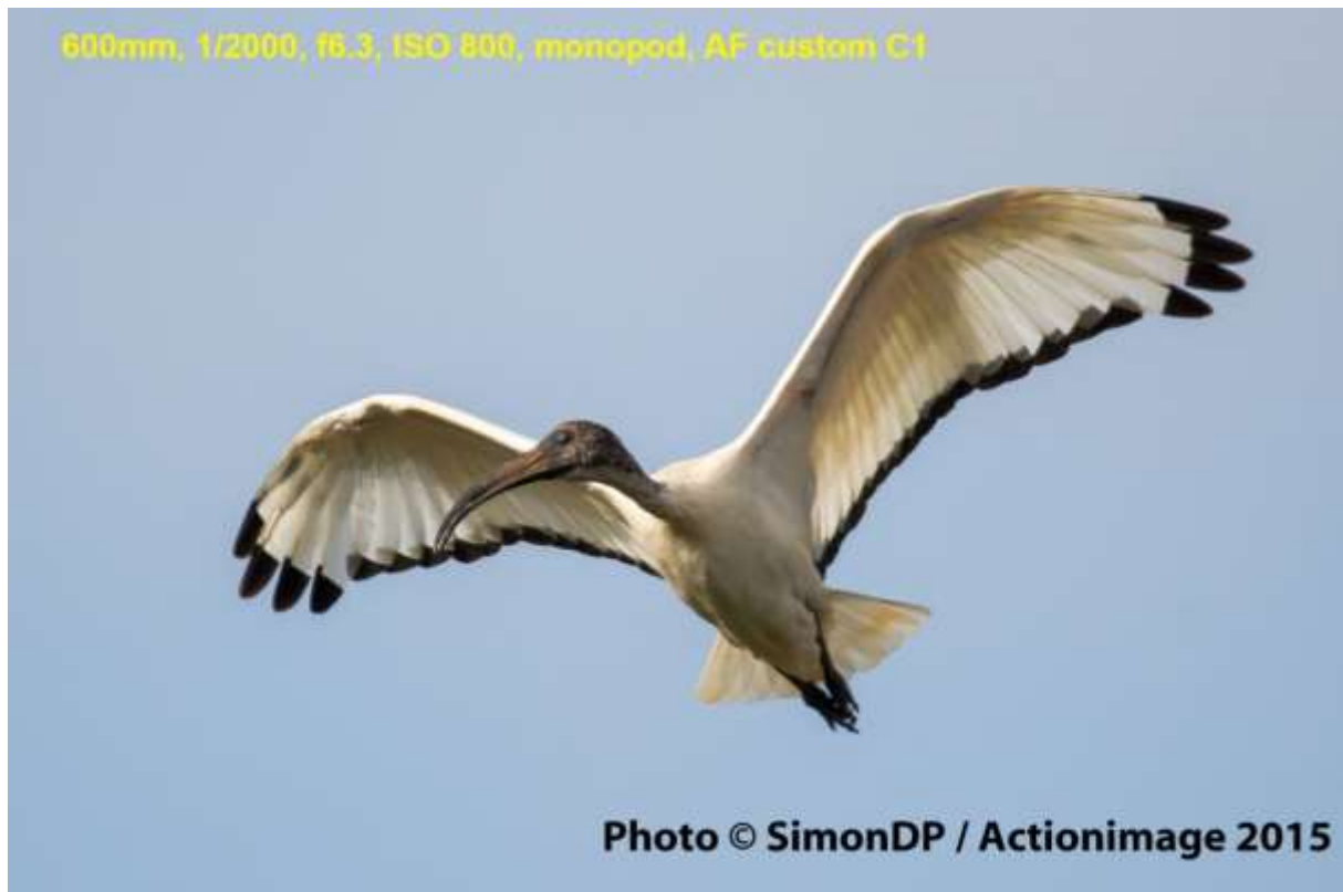
Sacred Ibis flyby (Custom AF setting with USB Dock)

I am happy to report that the keeper rate improved dramatically, from around 35-40 % to about 70% and maybe more, with a slight improvement in panning sharpness keeper rate as well. See the photo of West Indies strike bowler Sheldon Cottrell in action. This was really good news to me, as the "Sport" designation of the lens really started to make sense to me now. Already I was getting excited with the planned motorsport tests to follow in a few days' time.