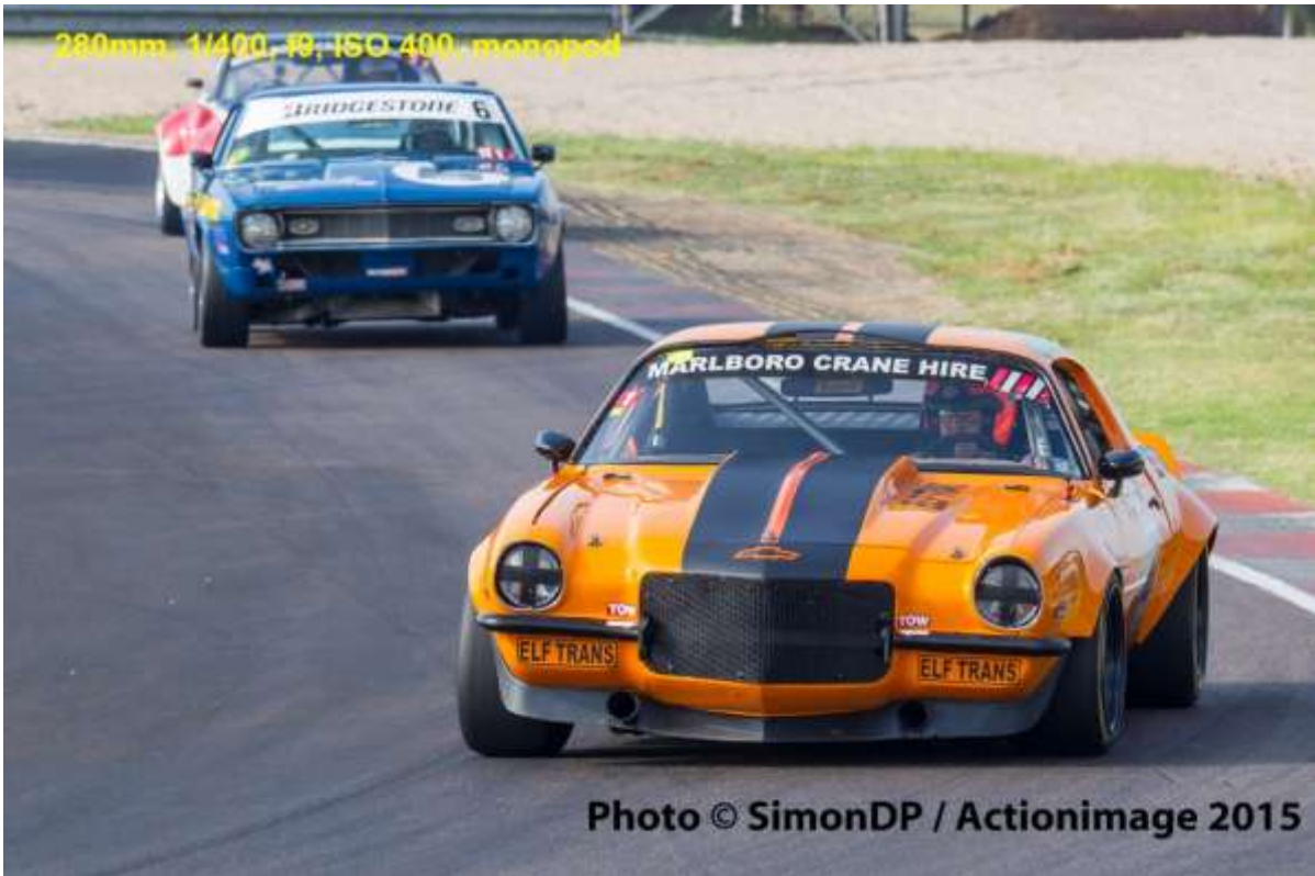
Head-on tracking with Chev Camaro